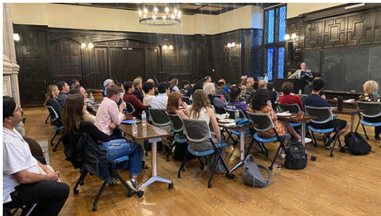
Award-winning author Richard Rhodes visits Yale for keynote talk on “The Rise of Malignant Deterrence”