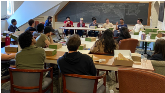
Society of Physics Students hosts regional meeting